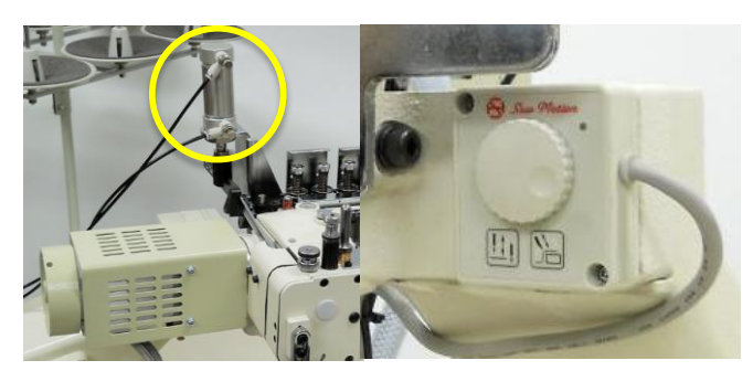
Direct drive servo motor, presser foot lifter & digital hand pulley are included.

Adapted fixed type needle guard. Stitch length & differential ratio can be changed without adjusting the needle guard position.